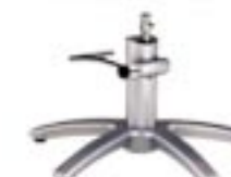
SP - VE