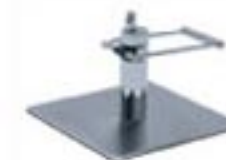
SP - YFS