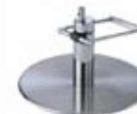
SP - YFL