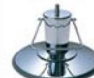
SP - AC/AD