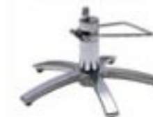
SP - YA

If you require any further information on this product and the available options, please contact our London office on hairdressing@takara.co.uk